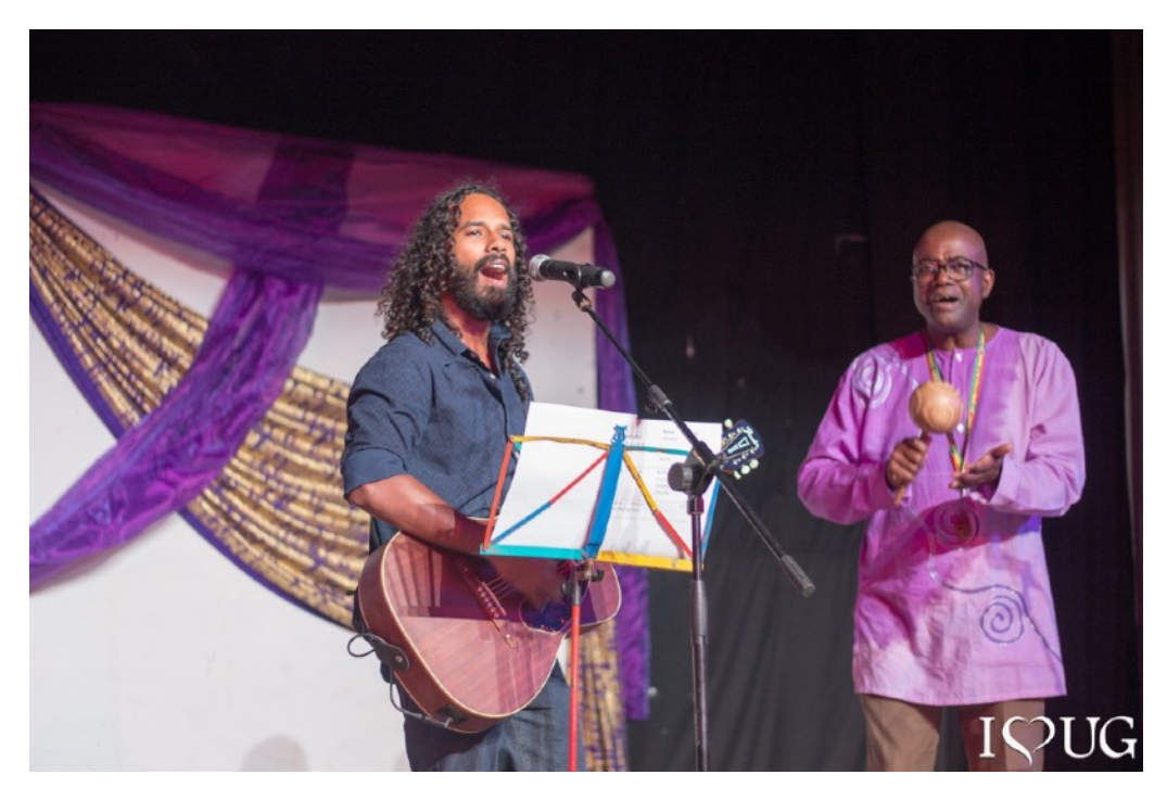
Performing with Legendary Guyanese Flautist - Keith Waithe