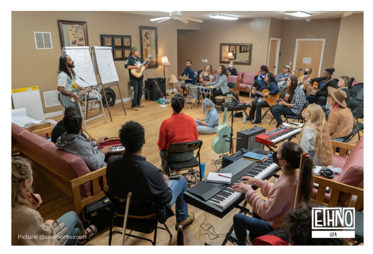
Teaching 'Small Days' to musicians from around the world at Ethno USA 2022 in North Carolina