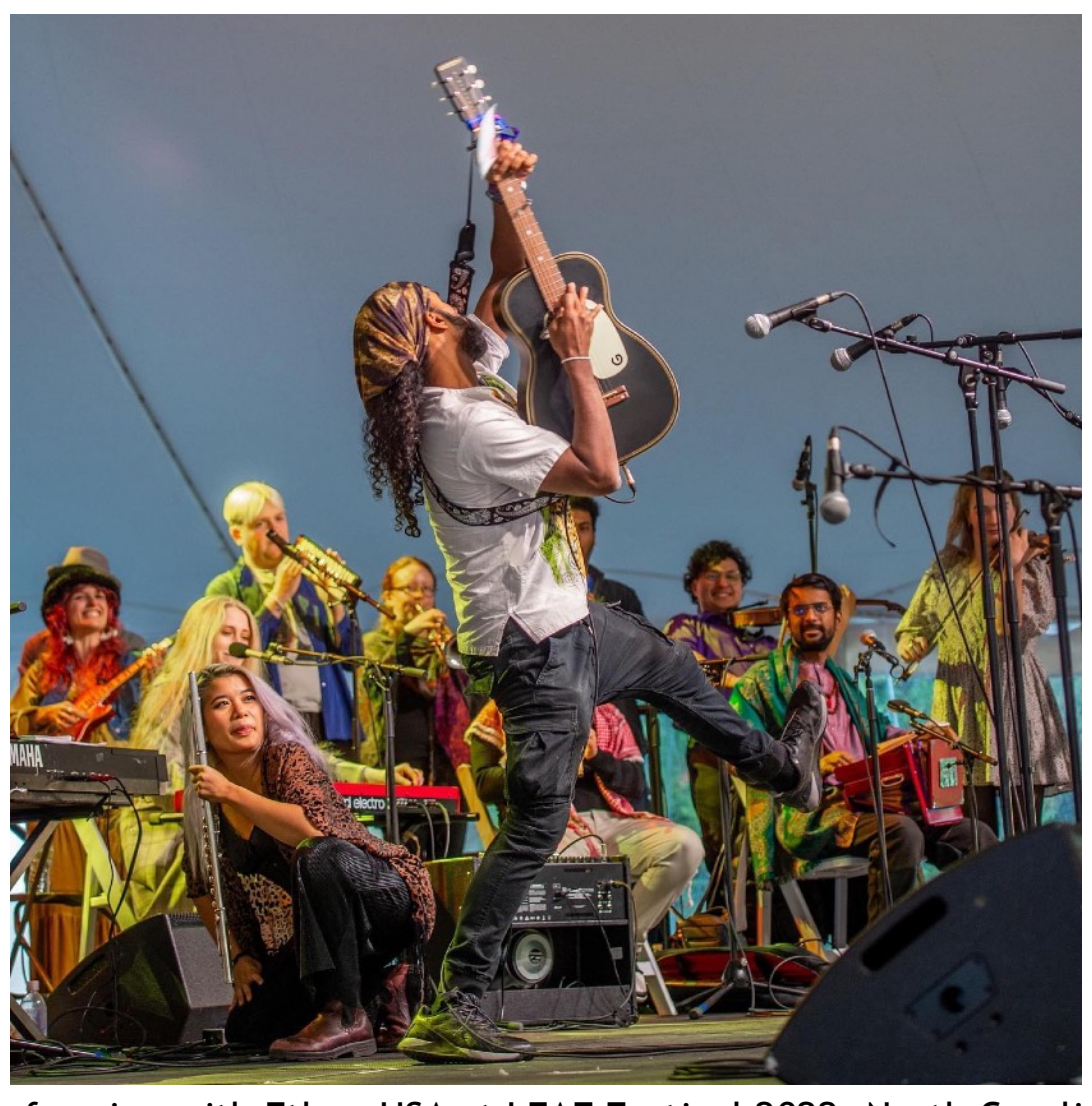
Performing with Ethno USA at LEAF Festival 2022, North Carolina