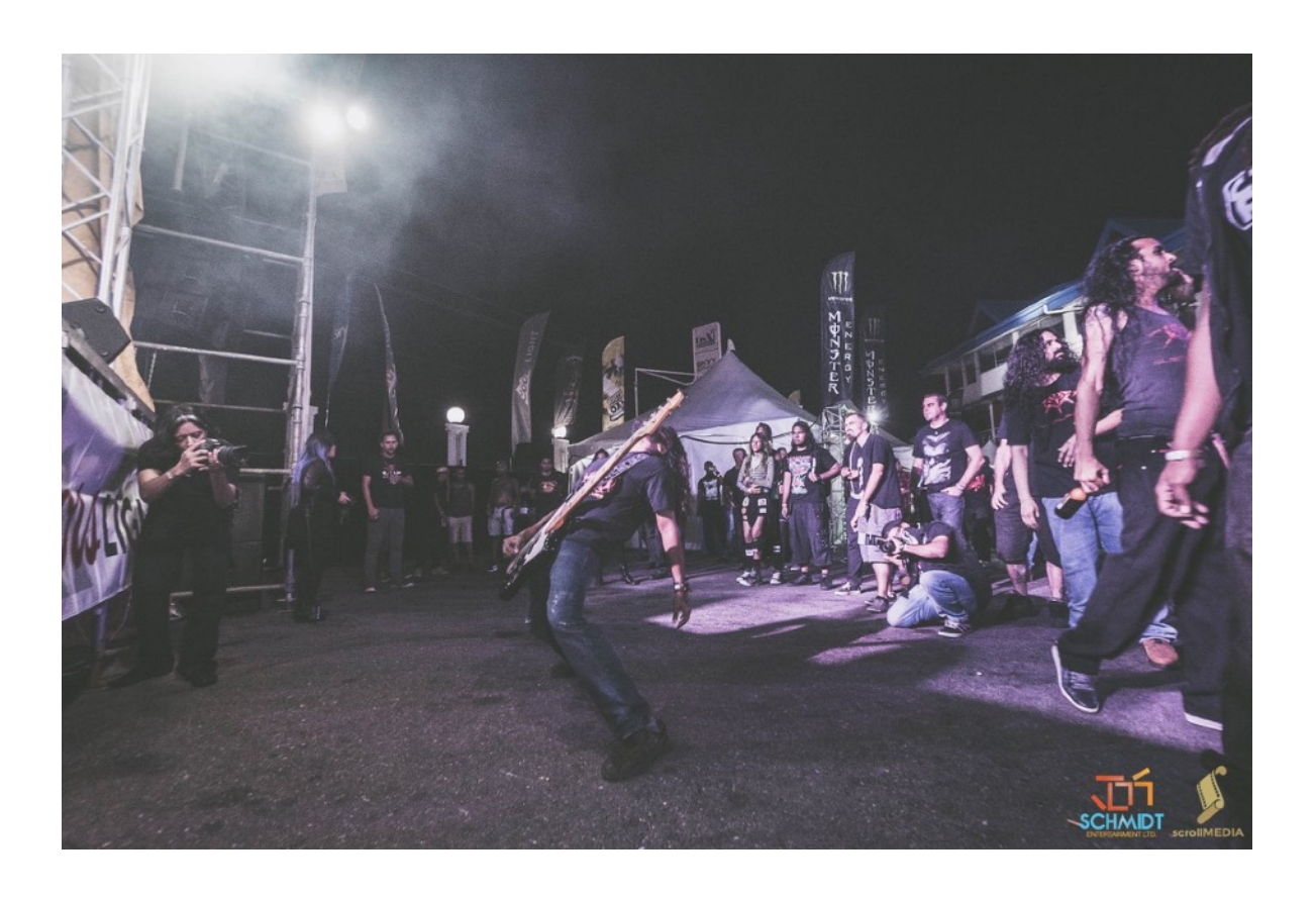
Performing in the crowd at Skyy Rock Festival, Trinidad 2017