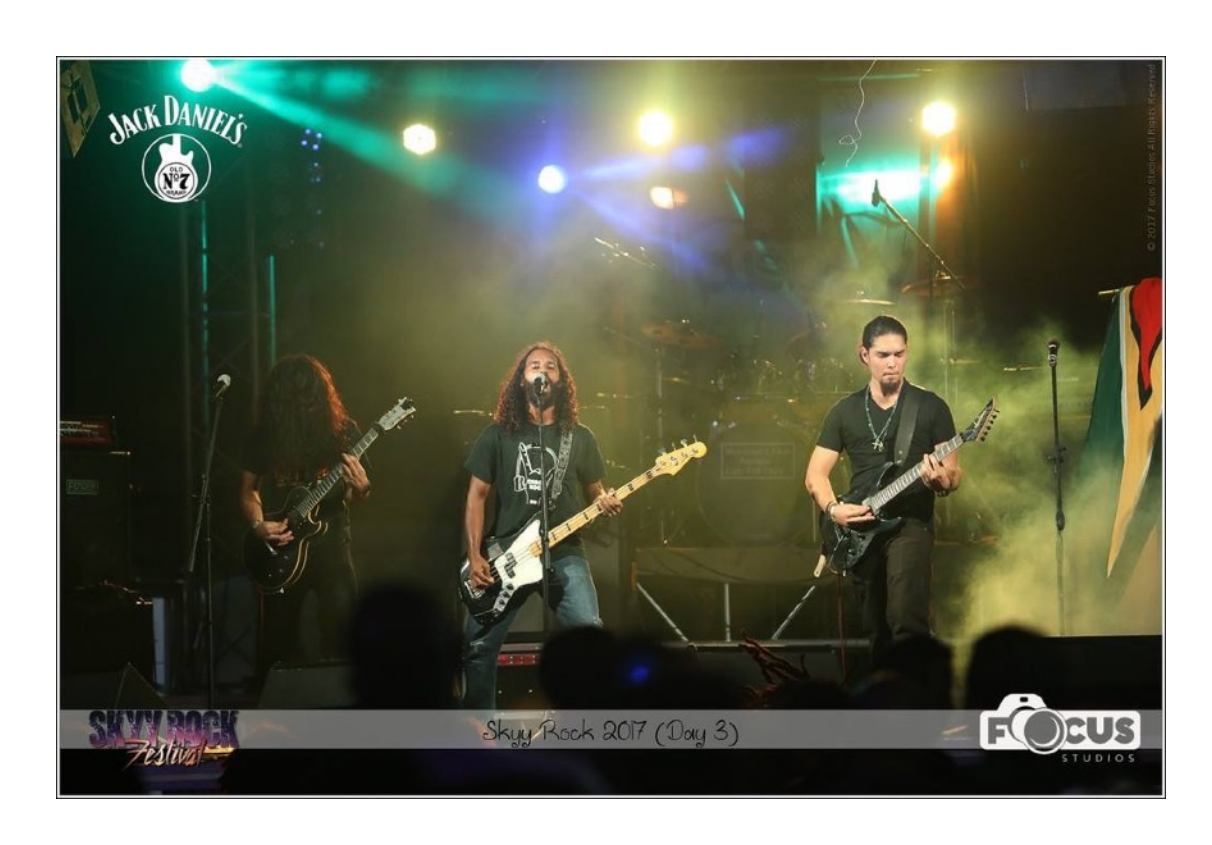
Performing with Feed The Flames at Skyy Rock Festival, Trinidad 2017